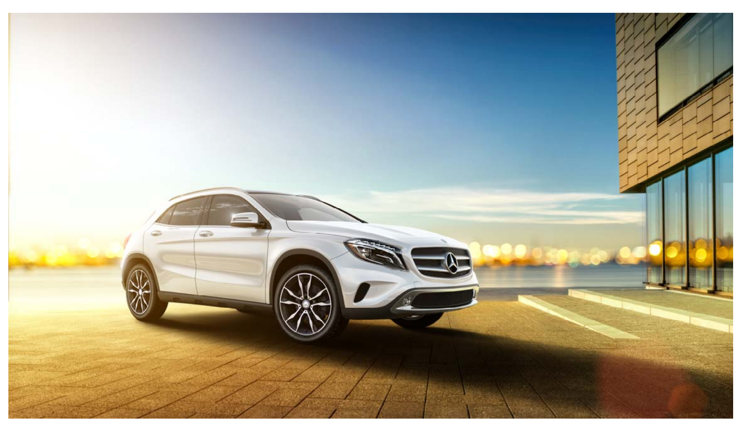
Keeler Motor Car Company