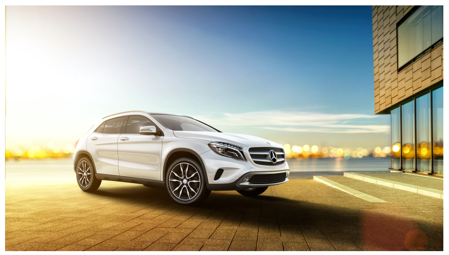
Keeler Motor Car Company