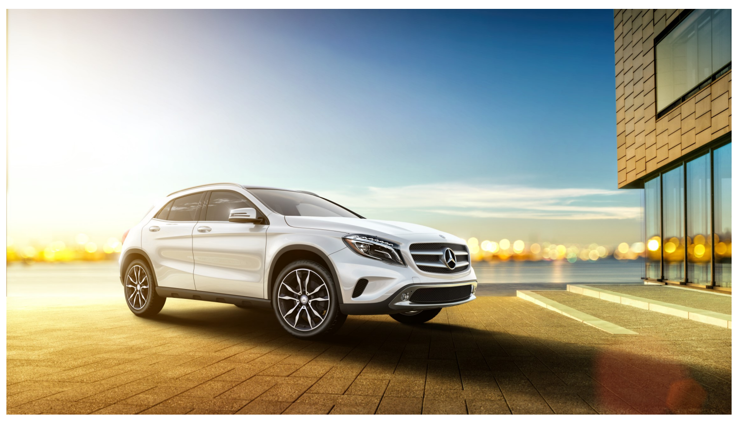
Keeler Motor Car Company