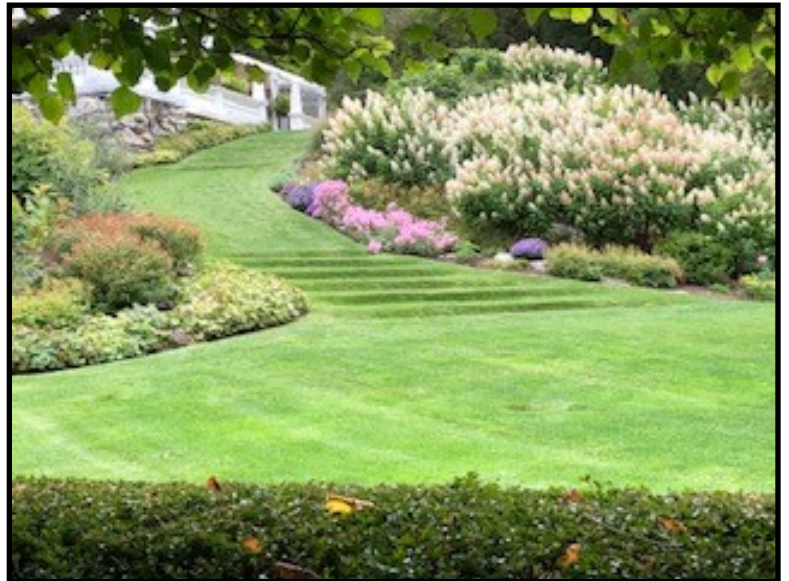
GARDENS OF THE MOUNT—THE GRASS STAIRS