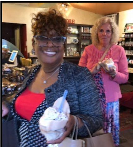
YUM! HOME MADE ICE CREAM