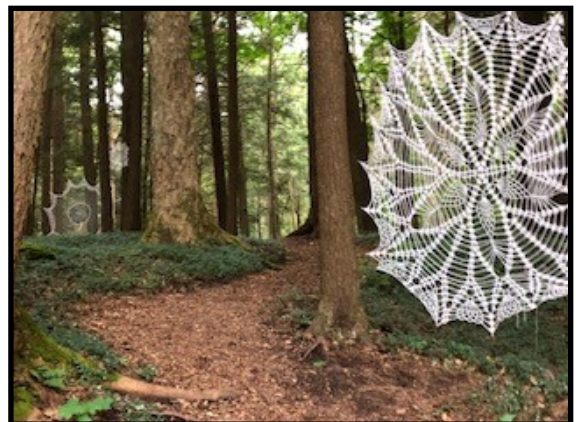
Webs in the Woods, art show